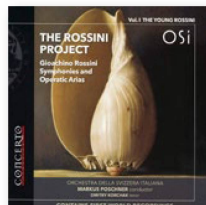
ORCHESTRA SVIZZERA ITALIANA The Rossini Project: Vol. II, The Young Rossini, Concerto Classics 2020 Rossini: Symphonies and Operatic Arias, Concerto Classics 2018

A concert guest from Zurich may wonder during the interval, while taking a breath of fresh air and watching the shooting stars fall over San Salvatore by the light of the moon, why lightness of being is always a feature of Lugano concerts. Instead of wheeling out the traditional Mediterranean clichés or talking about the permanent holiday atmosphere in Ticino, they might be better off seeking an explanation in the concert’s start time: 20.30.