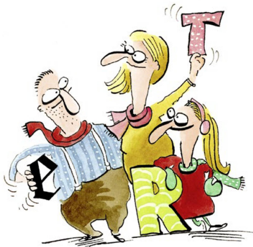
Cartoon: Max Spring

Neutrality in the 'Historical Dictionary of Switzerland': revue.link/neutral