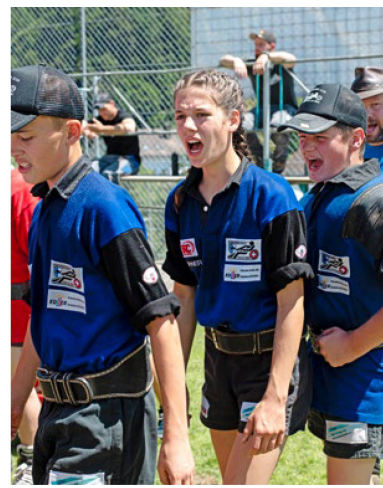
Ready for victory – the Ebersecken youth team psyches itself up for the pull.

Due to space constraints, the actual World Championships venue will be Campus Sursee in the nearby small town of Sursee. According to Glanzmann-Hunkeler, one goal is to increase awareness of the sport of rope pulling in Switzerland. While “Schwingen”, or Swiss wrestling, has become popular and hip in urban circles as well, rope pulling has a low profile. In Ebersecken, however, the sports field erupts in pandemonium