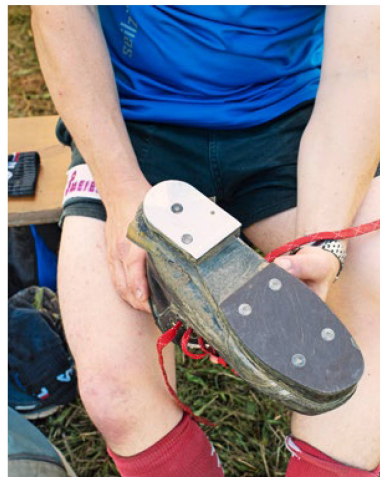
The shoes are custom made, with a metal plate permitted on the heel.