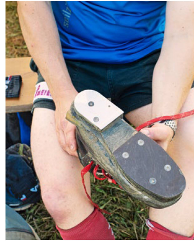
The shoes are custom made, with a metal plate permitted on the heel.