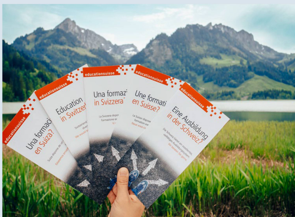
Information on education and training in Switzerland is available in numerous languages.