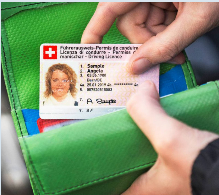
Driving licences in Switzerland are now only available in credit card format.

Question: I have been living abroad for many years outside the EU/EFTA area and have now learned that Switzerland's old blue paper driving licence will no longer be valid after 31 January 2024. It must be changed into a driving licence in credit card format, apparently. Neither the Swiss consulate nor my road traffic office in Switzerland were able to assist me. Surely there should be a way for Swiss Abroad to avoid losing their old Swiss driving licence. What can I do?