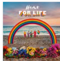
HECHT: "Hecht for Life" Gadget, 2022

Forever young, with loud colours everywhere and cheerful music to match. Eye and ear-catching band Hecht rule the Swiss German dialect scene at the moment. Four years on from their successful and most recent album "Oh Boy", the Lucerne combo are now back with a chart-topping record that mainly appeals to young listeners. The quintet will round off their current tour with a performance at Zurich Hallenstadion in November.