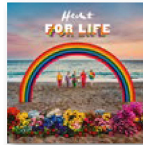
HECHT: "Hecht for Life" Gadget, 2022

Forever young, with loud colours everywhere and cheerful music to match. Eye and ear-catching band Hecht rule the Swiss German dialect scene at the moment. Four years on from their successful and most recent album "Oh Boy", the Lucerne combo are now back with a chart-topping record that mainly appeals to young listeners. The quintet will round off their current tour with a performance at Zurich Hallenstadion in November.