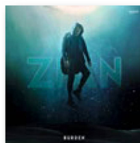
ZIAN: "Burden", Sony, 2022

It was one of last year's biggest Swiss hits, taking the charts by storm virtually overnight. The song was "Show You", the singer Zian. No one had heard of him before. Who is he?