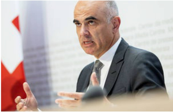
Health Minister Alain Berset sees the people’s resounding yes as an expression of appreciation and gratitude towards the nursing staff.