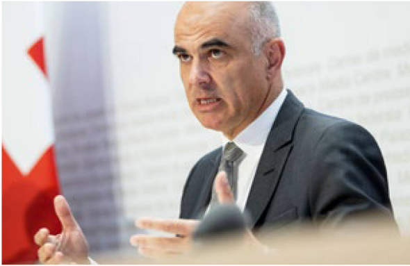
Health Minister Alain Berset sees the people’s resounding yes as an expression of appreciation and gratitude towards the nursing staff.

Councillor Matthias Jauslin (canton of Aargau). These compromises are up for debate again. “The legislative process is at square one,” he said. Under the terms of the initiative, both chambers have four years to complete this process.