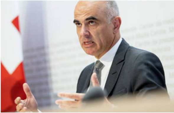
Health Minister Alain Berset sees the people’s resounding yes as an expression of appreciation and gratitude towards the nursing staff.

Councillor Matthias Jauslin (canton of Aargau). These compromises are up for debate again. “The legislative process is at square one,” he said. Under the terms of the initiative, both chambers have four years to complete this process.