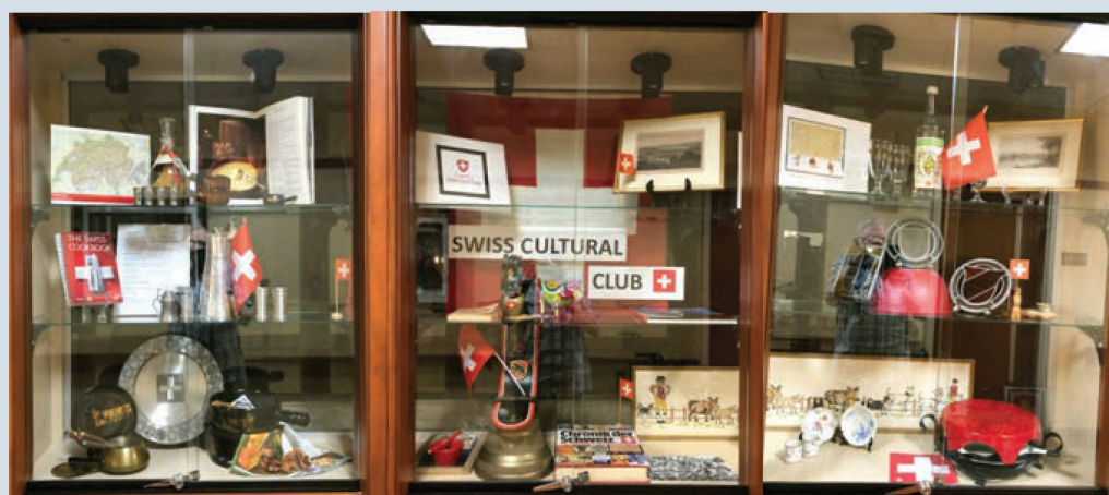
The Swiss Cultural Club at Cedar Crest Village in New Jersey is showcasing our Swiss history and traditions to educate our fellow residents that we Swiss are more than chocolate, cheese, and brown cows.