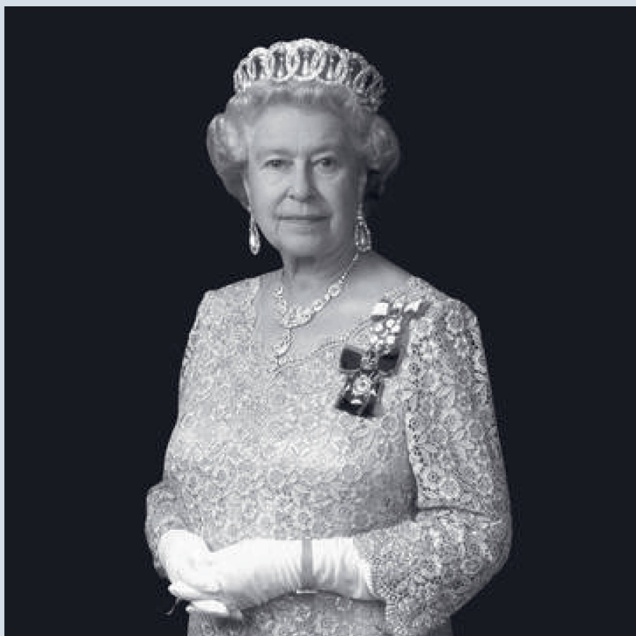
The Queen passed away on the 8 th of September 2022.