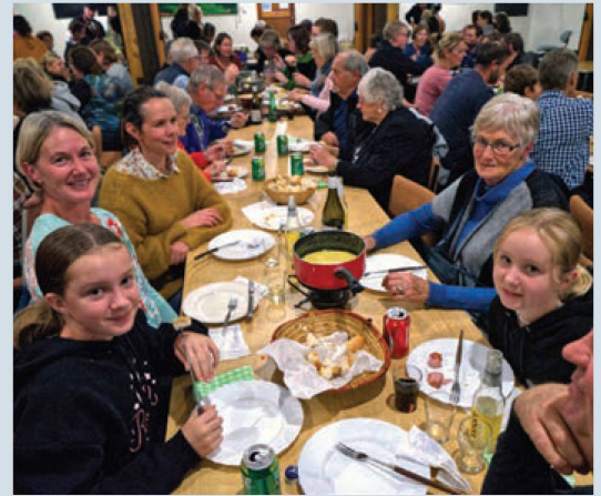
Taranaki Fondue Night.

30/7: Swiss National Day celebrations, together with Jungbürgerfeier for our young people turning 18, Club House in Kaponga.