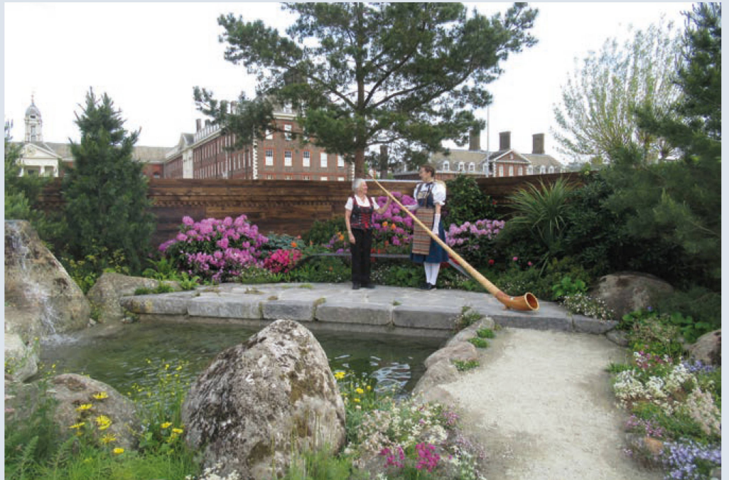
Alphorn player Frances Jones supplied gentle musical melodies to complete the timeless idyll of the Swiss Sanctuary Garden.

The front of the garden opened with low-growing saxifrages, gentians and edelweiss either side of a gravel path, reminiscent of a hiking trail, that led to a waterfall that plunged into a two-metre rock lined pool. Beyond was a paved area of irregular fossil-encrusted slabs with sedums sprouting in the crevices, which supported a metal bench designed to resemble the criss-crossing of railway tracks. Towards the back of the garden were ferns, rhododendrons and pine trees, and the back boundary fence was created from carved wooden boards reminiscent of the decorations on a Swiss chalet.