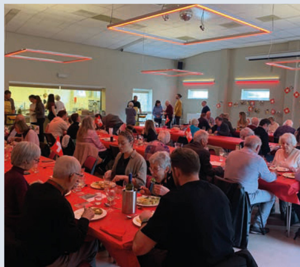
Raclette Party on Sunday, 13 th March 2022 at the Brookdale Club.