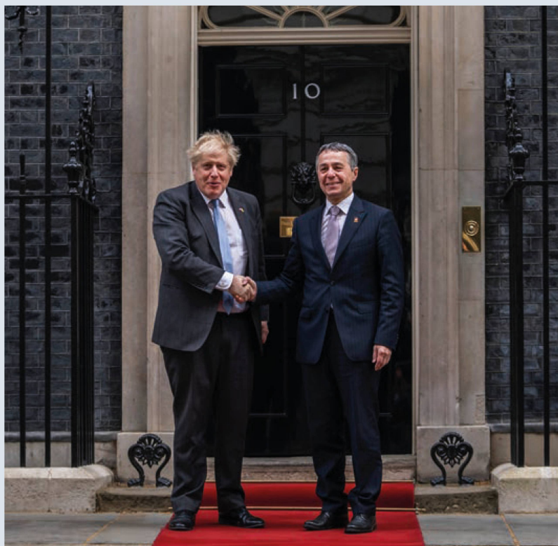
President Ignazio Cassis met with British PM Boris Johnson and was also invited to pay a courtesy visit to the Queen.

The UK is Switzerland's eighth most important trading partner (ex-