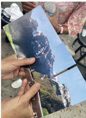
Putting together two pieces of the four-piece Swiss photo puzzle.

answers to several questions by searching through our new website. Teams of four were created after everyone selected a piece of several photos and looked for the other members who held the missing pieces to create a whole photo of a Swiss landscape. It was fun to mingle and learn more about our new website, Switzerland, and our members.