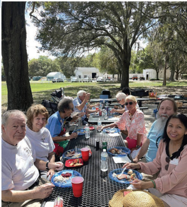
Enjoying a potluck luncheon in the shade of Cypress trees. Another beautiful Florida day!

A beautiful spring day was the backdrop for our Annual Meeting which was preceded by a delicious potluck luncheon. About 25 members enjoyed several typical Swiss dishes under the canopy of Cypress trees while catching up with old friends and meeting our youngest members, Elina (5 months) and Aurelia (25 months).