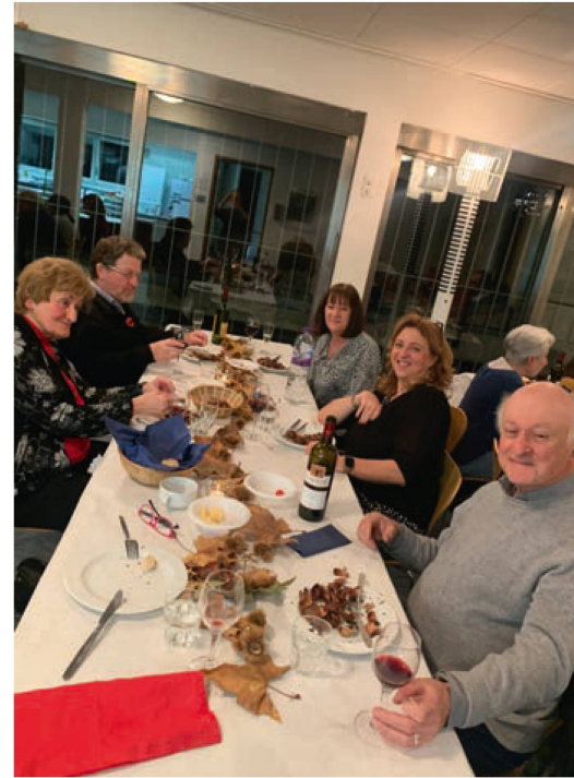
Traditional 'ticinese castagnata' at the Embassy canteen.

The Unione Ticinese's next event will be its Annual General Meeting on 26 March. It will be a hybrid event, which we hope will be combined with a cultural event and a reception.