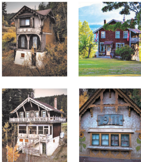
Edelweiss Village Homes

A closer look at Golden’s Edelweiss Village reveals a cluster of six picturesque chalets built in a pseudo-Swiss architectural style.