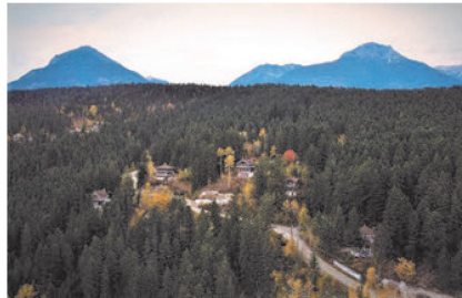
Edelweiss Village - Aerial View

Golden is an ideal starting point for mountaineering expeditions - the town is surrounded by the Columbia and Rocky Mountains, and it is centrally located in relative proximity to no less than six Canadian National Parks: Banff, Glacier, Jasper, Kootenay, Mount Revelstoke, and Yoho.