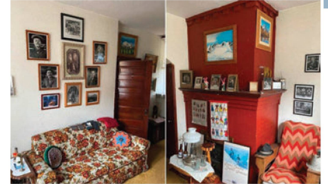
Edelweiss Village - Interior Views

housing for the Swiss allowed the guides to relocate their families to the Village in Golden and dispense with the yearly commute.