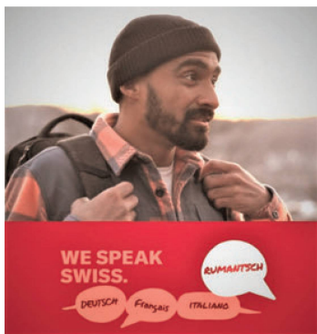
Snook © Tanja N. Maihoff | Infographie © DFAE