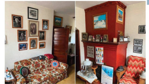
Edelweiss Village - Interior Views

housing for the Swiss allowed the guides to relocate their families to the Village in Golden and dispense with the yearly commute.