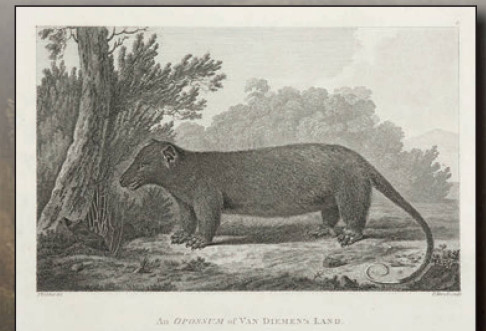
John Webber: Sketch of a possum, Tasmania, 1777. State Library of Tasmania

Sources: Museum of New Zealand; Dictionary of Canadian Biography