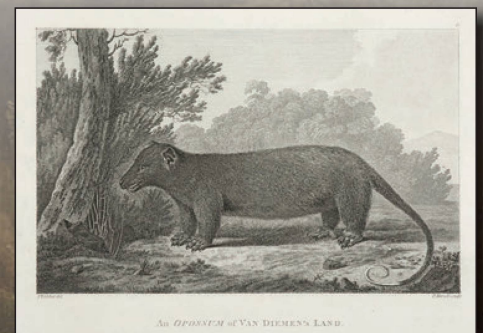
John Webber: Sketch of a possum, Tasmania, 1777. State Library of Tasmania

Sources: Museum of New Zealand; Dictionary of Canadian Biography