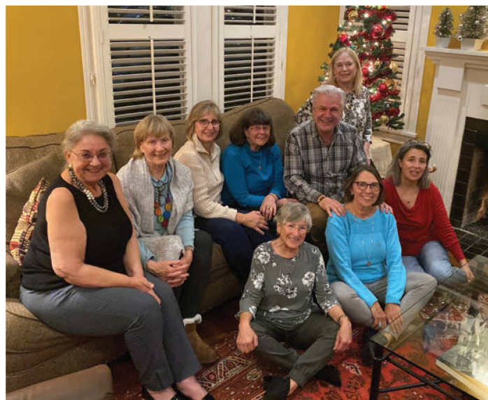
SASH Board Members from left to right: