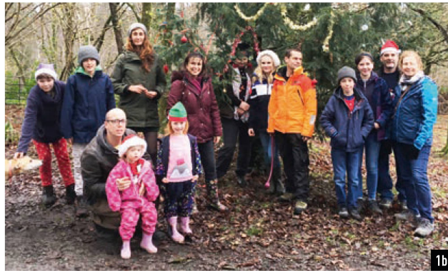
This event in the nature turned out for everyone to be much funnier than holding it indoors.