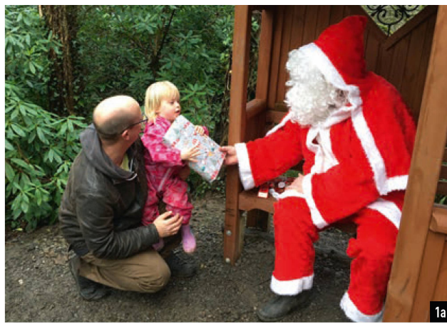
Kids super excited to met Samichlaus in the wood!