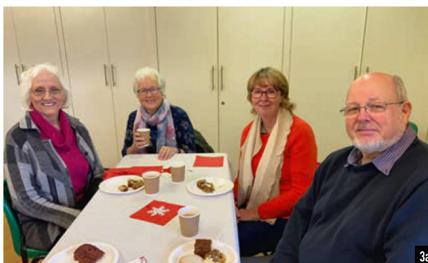
The Southern Area Swiss Club met for the first time in almost two years.