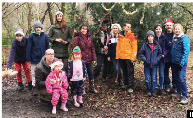
This event in the nature turned out for everyone to be much funnier than holding it indoors.