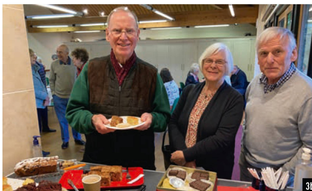
Everyone thoroughly enjoyed seeing each other.