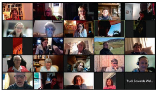
Members of the conversation chat on Zoom.