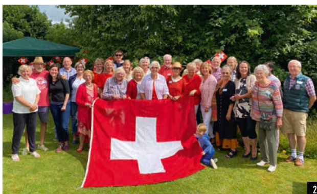
The Taunton and Somerset Swiss Club remains a very happy and lively group of Swiss nationals of all ages.