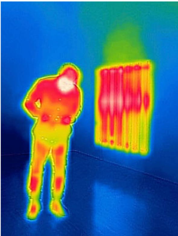
Which is giving off more warmth? The radiator or the heating engineer's body?

Two lovers look into each other's eyes – their faces two red islands of warmth. A protective mask covers nose and mouth – like a thermal heat shield under burning eyes – with hair, head and neck combining to create a fiery image born of the Covid-19 pandemic. Thermal images along a colour spectrum ranging from light green to dark red are familiar to anyone who has dealt with house energy efficiency issues such as gaps in insulation.