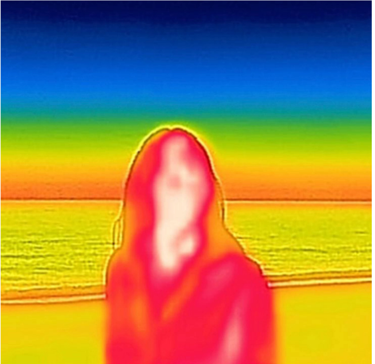
The setting sun warms the body of French actress Lolita Chammah, daughter of Isabelle Huppert