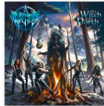
BURNING WITCHES: "The Witch Of The North" Nuclear Blast, 2021

They certainly haven't decided to reinvent the wheel. On the contrary, Burning Witches play a very traditional not to say old-fashioned type of heavy metal. Be that as it may, the Swiss combo have a certain something. On the one hand, they are an all-women band – still something of a novelty in their particular genre. Without doubt, this has turned heads. But they also market themselves very cleverly, portraying themselves as timeless fantasy heroines, maiden warriors, and witches – strong female characters whose powers are as striking as their looks.