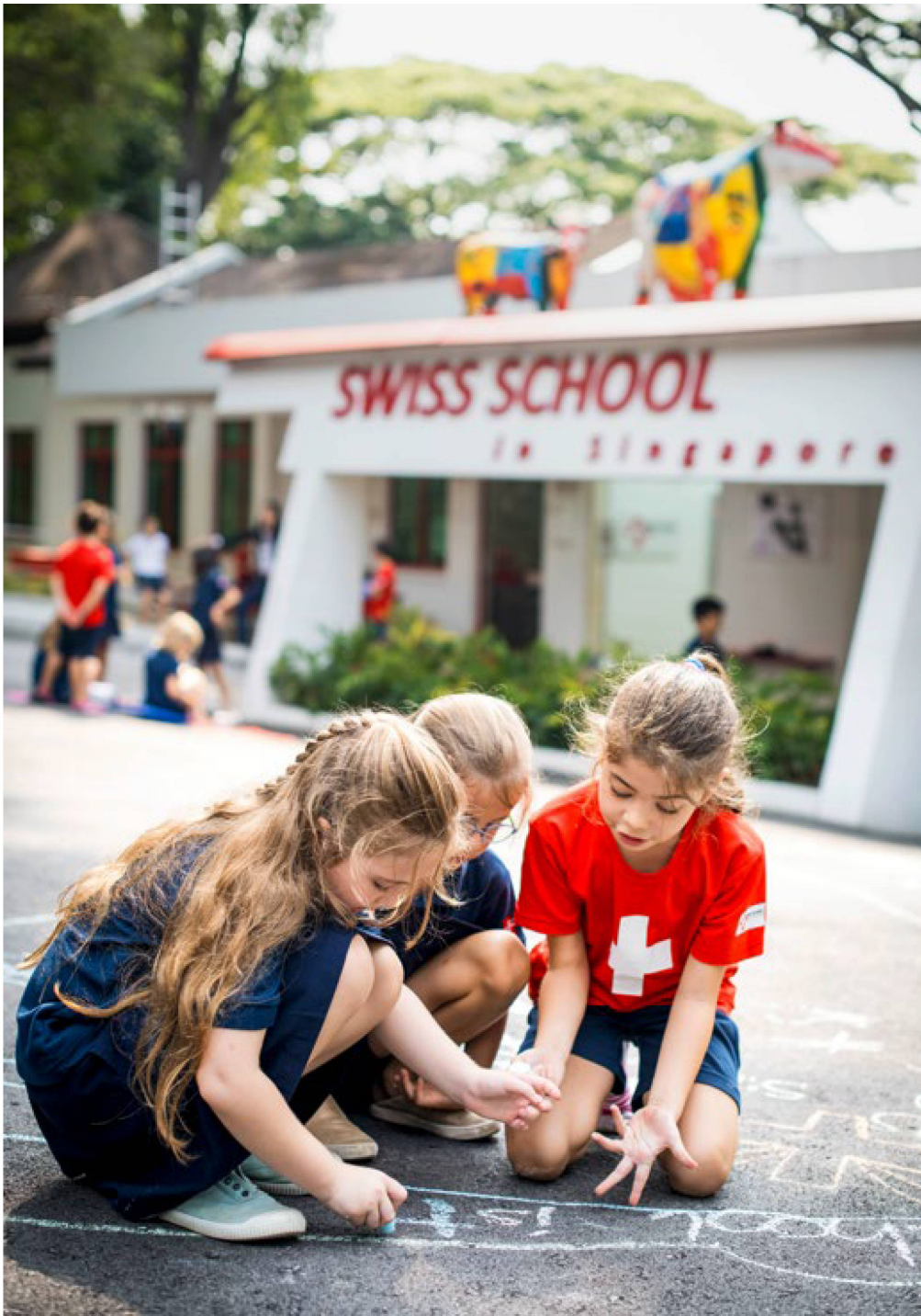
Playing during the break at the Swiss School in Singapore. Photo provided

The Swiss Confederation supports the 18 officially recognised Swiss schools abroad. All these places of learning not only provide Swiss education around the world, but also contribute to Switzerland's cultural footprint abroad, thereby promoting understanding of our country and its traditions and values.