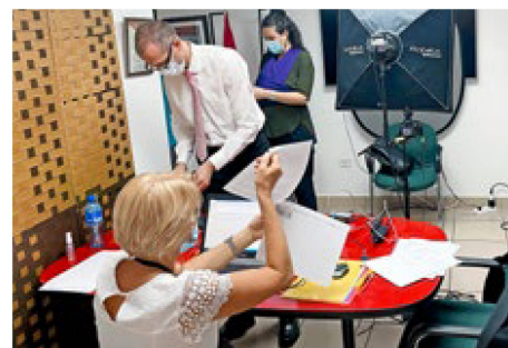
Our mobile passport office in Panama – travel restrictions make this a very popular service

Under the "Six countries, one region" tag line, the RCC's next event will take the form of a hybrid meeting: six colleagues who specialise in consular services at our six representations in Central America will meet in person in Costa Rica, from where they will conduct a video call with our