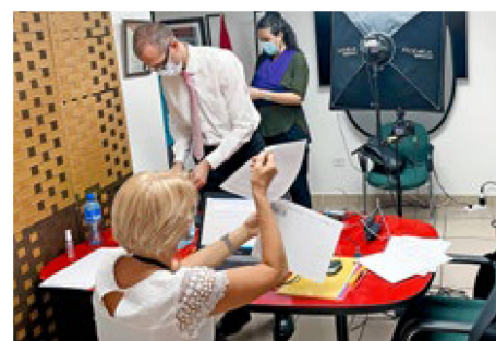
Our mobile passport office in Panama – travel restrictions make this a very popular service

Under the "Six countries, one region" tag line, the RCC's next event will take the form of a hybrid meeting: six colleagues who specialise in consular services at our six representations in Central America will meet in person in Costa Rica, from where they will conduct a video call with our