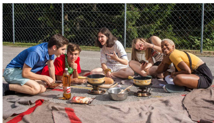
Enjoying fondue at the 2019 Sainte-Croix sports and holiday camp – before face coverings and social distancing

Of course, the Organisation of the Swiss Abroad is closely monitoring the evolution of the pandemic in the world. Any change which may impact the organisation of the camps will be announced on the website www.swisscommunity.org .