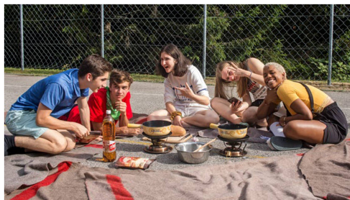
Enjoying fondue at the 2019 Sainte-Croix sports and holiday camp – before face coverings and social distancing

Of course, the Organisation of the Swiss Abroad is closely monitoring the evolution of the pandemic in the world. Any change which may impact the organisation of the camps will be announced on the website www.swisscommunity.org .