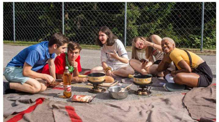
Enjoying fondue at the 2019 Sainte-Croix sports and holiday camp – before face coverings and social distancing

Of course, the Organisation of the Swiss Abroad is closely monitoring the evolution of the pandemic in the world. Any change which may impact the organisation of the camps will be announced on the website www.swisscommunity.org .