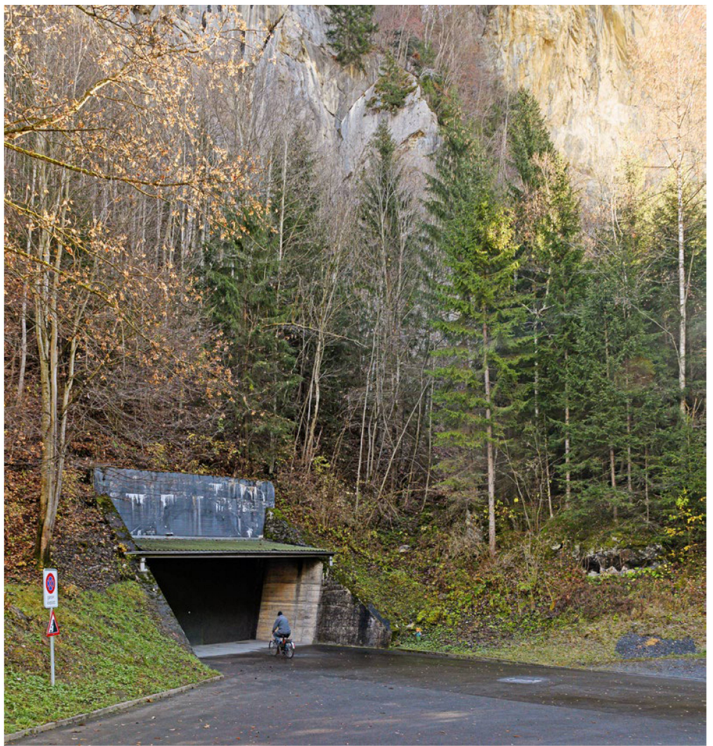
The Mitholz depot has an inconspicuous entrance but has been a ticking time bomb for decades.

This never transpired. Not a single shot was fired in anger with weapons from the Mitholz cache. On the contrary, depots like Mitholz were used after the war as a convenient place to dump unused ammunition. The Mitholz store, built before the Second