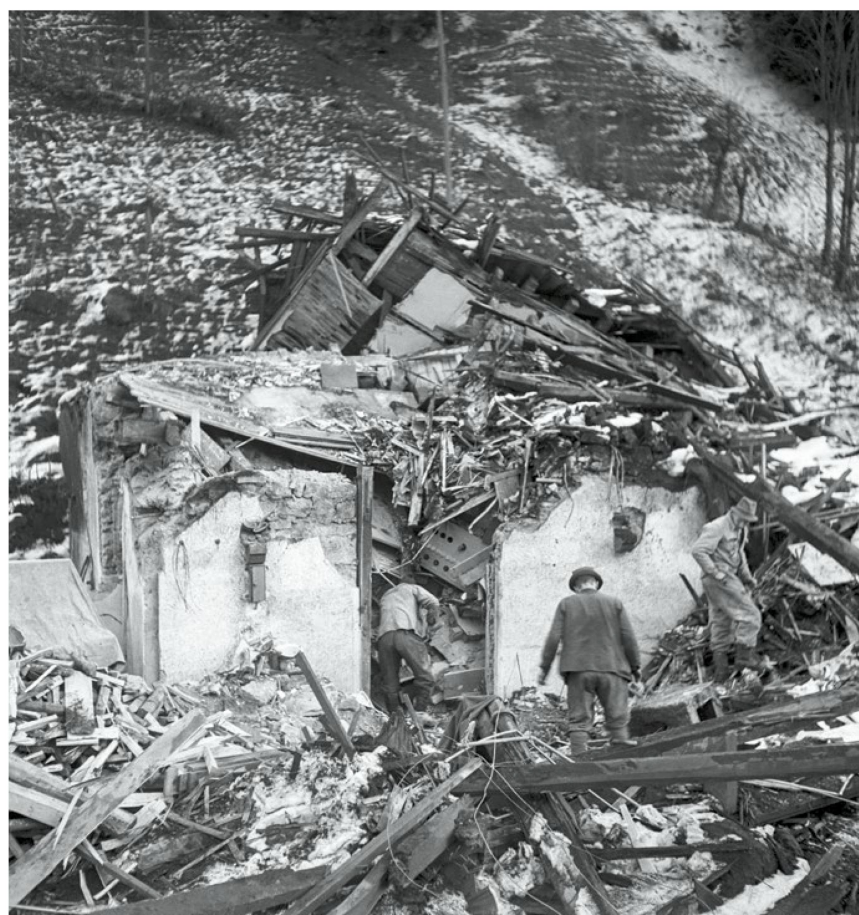
Debris in the village after the 1947 explosions – nine people died and many houses were destroyed.