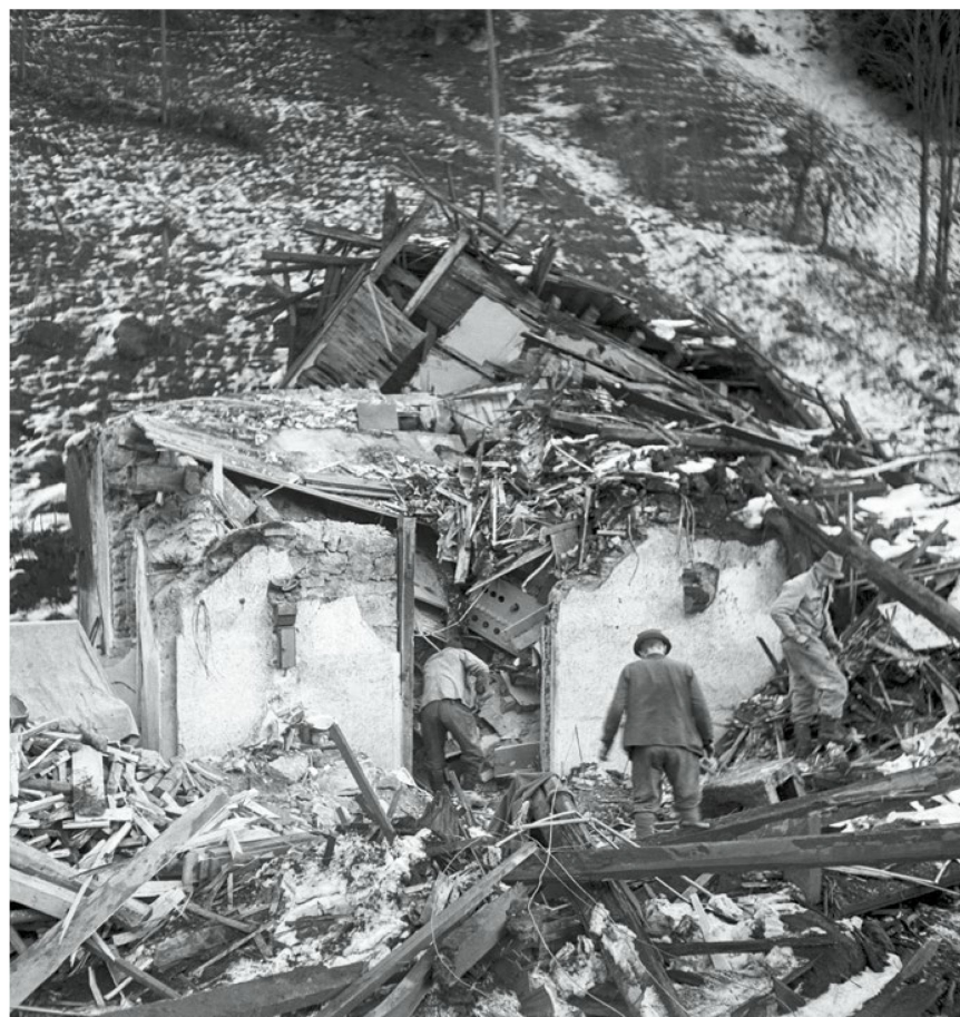
Debris in the village after the 1947 explosions – nine people died and many houses were destroyed.