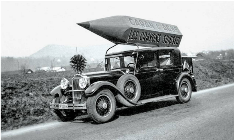
Pencil rocket – Caran d’Ache went on an advertising offensive at the end of 1920s.