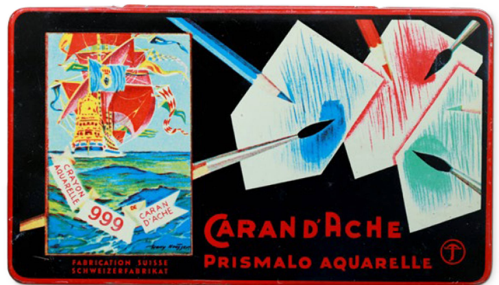
Caran d’Ache developed the Prismo watercolour colouring pencil in the 1930s. The cases containing multicoloured rows of pencils were popular among generations of Swiss children. (RB)