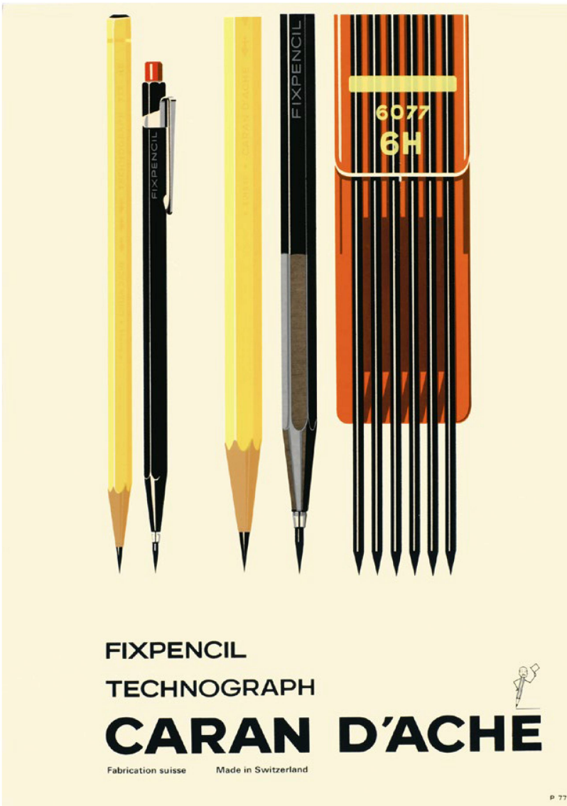
Caran d’Ache patented the Fixpencil in 1930. This new form of mechanical pencil was particularly popular among technical illustrators.