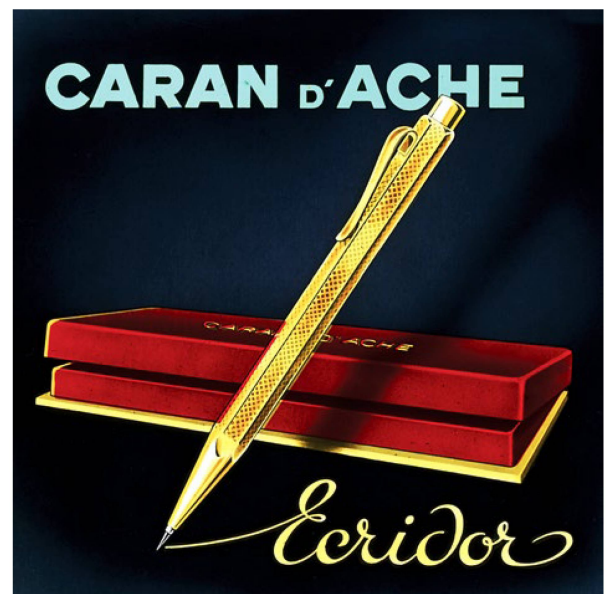
The Ecrivor – millions of these luxurious hexagonal pens were sold from 1953.