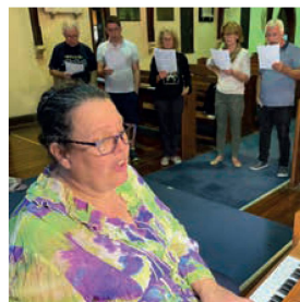
Yodel Choir & Folklore Group 'Baerg-Roeseli' hard at work