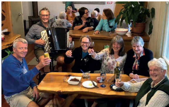
Fun time at the Hamilton Swiss Club weekend at Ohakune