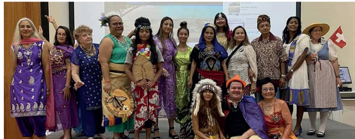
All dressed-up for the Fraser Coast Harmony Day