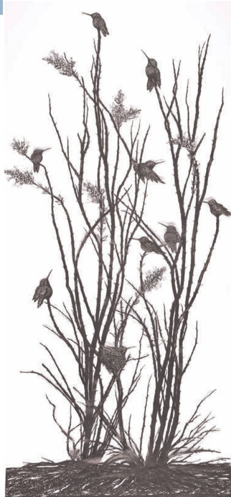
Ocotillo [2017; hand-cut black paper mounted on matt board, 60cm x 100cm, © Lucrezia Bieler]

“Transforming” is how Lucrezia Bieler describes her method: taking simple paper and turning it into strikingly complex and intricate designs using only a pair of scissors. She trained as a scientific illustrator but taught herself the art of paper cutting, which has a long history in Zurich, where she grew up and went to school. Now she lives