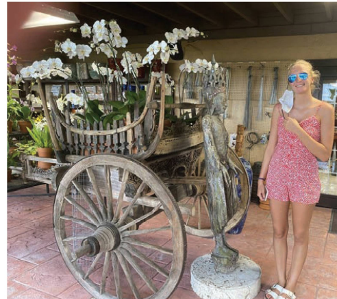
Stop at the RF Orchid Garden during our 2nd socially distanced Car Rally/Treasure Hunt this year at the Historic Redland Tropical Trail

enclave in the Redland. Another stop was the the Bird/Mary Heinlein Fruit & Spice Park where the first school in that area was built in 1903. The tropical botanical garden is the only kind in the United States. The tropical climate of the 37-acre botanical garden and park contains over 500 varieties of fruit, vegetables, spices and herbs. At the end of the Rally we had a picnic, and the winners got some prizes.