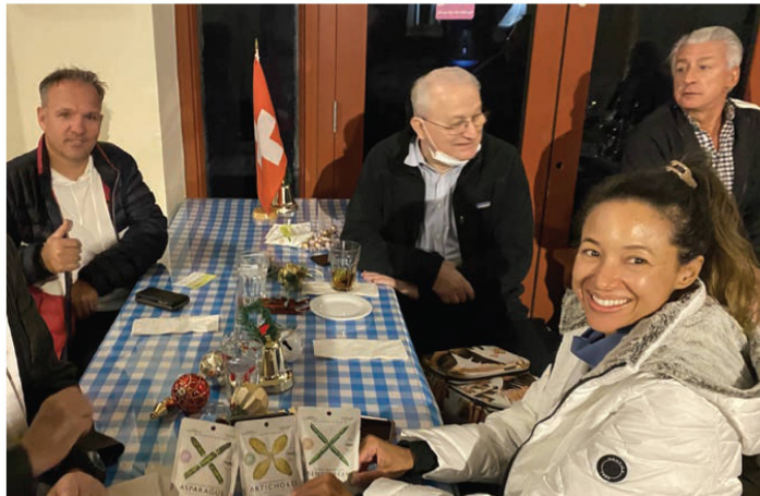
Our Stammtisch at Fritz & Franz