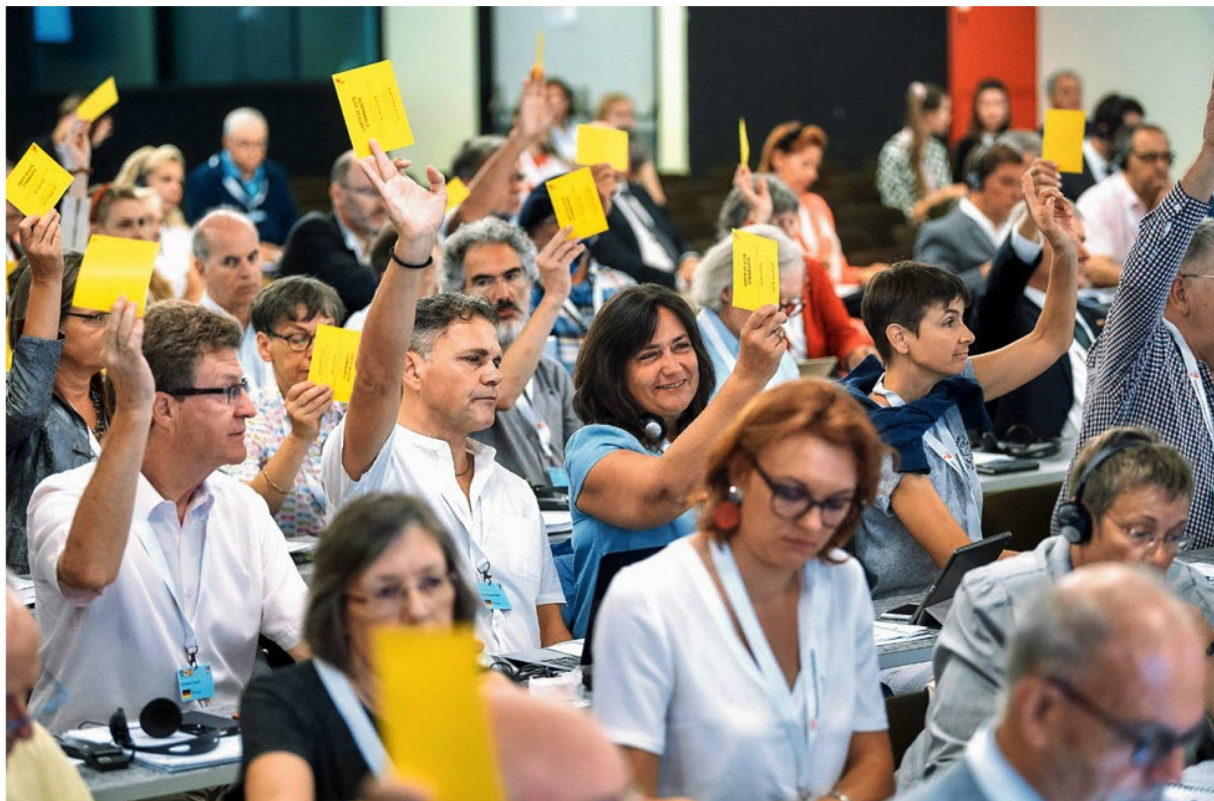
The Council of the Swiss Abroad meeting in Montreux – a show of hands calling on the Federal Council to do more on the issue of e-voting.