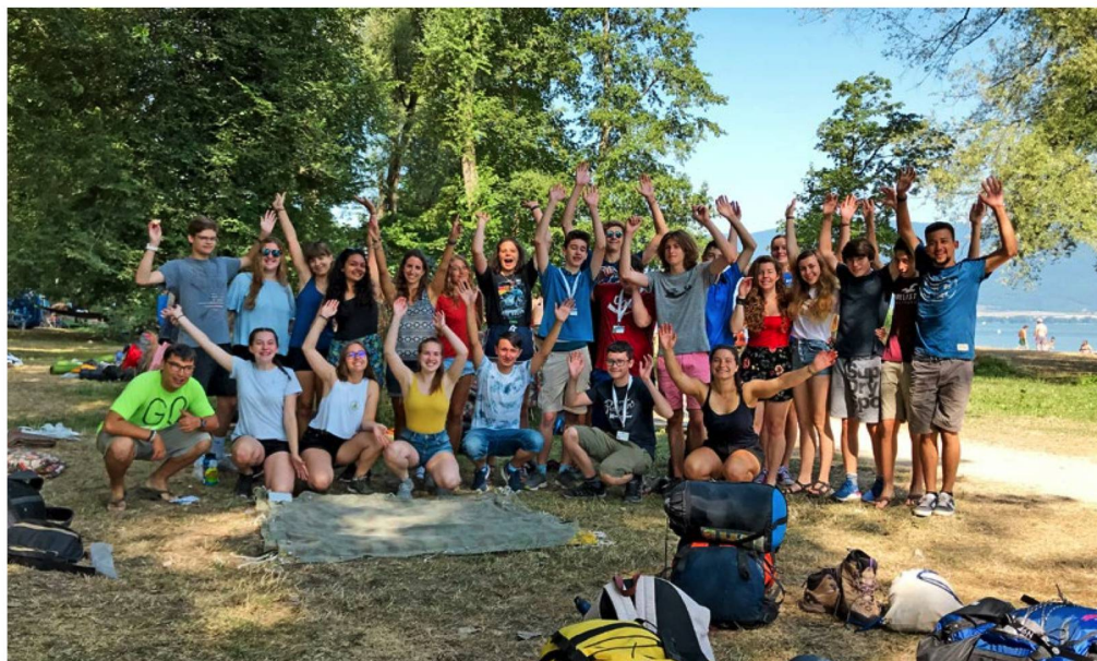
Swiss challenge, Yvonand, 2019.