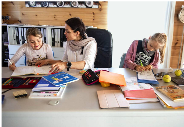
All schools remained closed (Golaten, canton of Berne). Children and parents contended with the double whammy of homeschooling and working from home. The lockdown was a challenging time for teenagers about to enter higher education or the world of work.