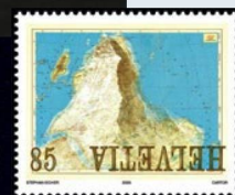
The Matterhorn disguised as Africa – Eicher designed his own postage stamp in 2005.