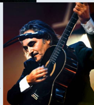
Eicher the maestro – Avo Session, Basel, 2011