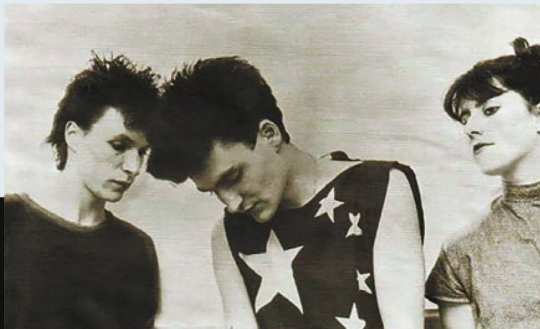
Martin Eicher, Stephan Eicher and Ingrid Berney formed post-punk band Grauzone in 1980.