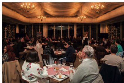
Pialligo Estate glass house

The event showcased a glimpse of what Switzerland and its unique natural landscapes have to offer. Who knows... once international travel restrictions will be lifted, the evening’s guests might have the opportunity to complete their Swiss experience with a nice holiday in the Alps!