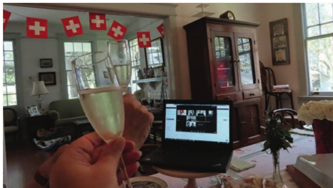
Joining the Consulate General of Switzerland in Atlanta virtual celebration. Prost, Santé, and Cheers!