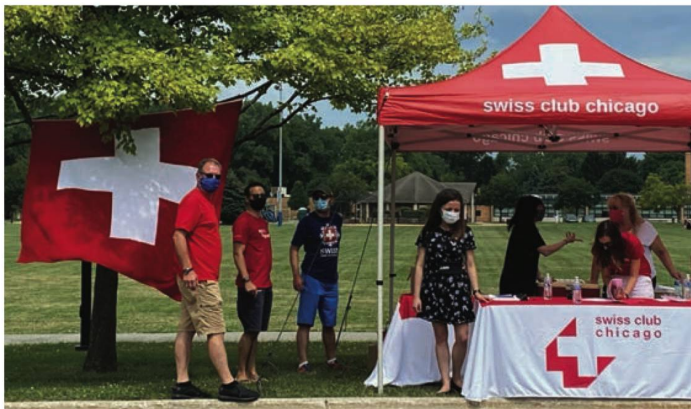
The Swiss Club of Chicago Board is ready!