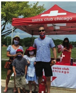
Family picking up their order

when we dropped their package in their cars. We also made a few deliveries to Swiss Seniors who live in nursing homes, since they were not allowed to leave their homes. It was a perfect day, albeit the new normal social distancing and wearing face masks.