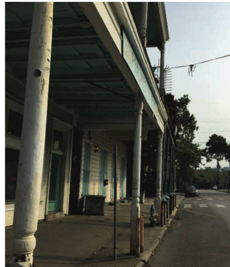
Empty street, St. Charles Avenue, Sunday, April 19, 2020

Stay well, be safe and hopefully things will be looking up by the time of our next submission.