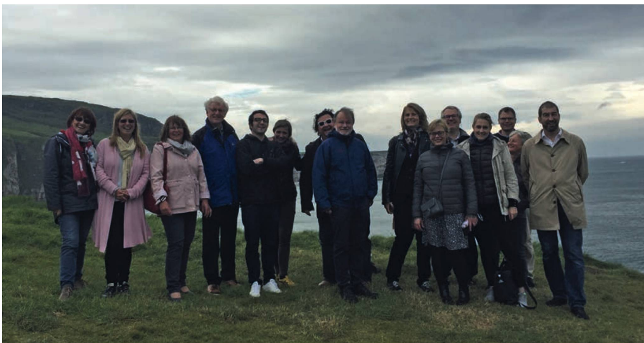
Some of FOSSUK's AGM participants during a trip to the Giant's Causeway. The event took place in Belfast in 2018.