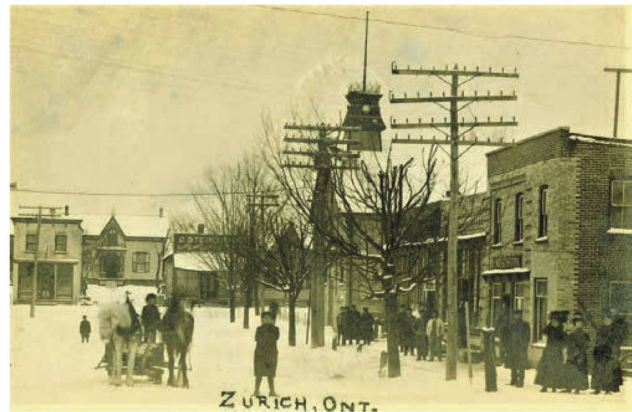
Namesake Puzzles Inspiration: Early Days in Zurich, Ontario. Source: www.Zurichontario.com

Ample puzzle hints and clues are provided; they may however be very subtle, so read carefully and ponder deeply! If you'd like to test a hunch, check out the two database links provided below. Good luck!