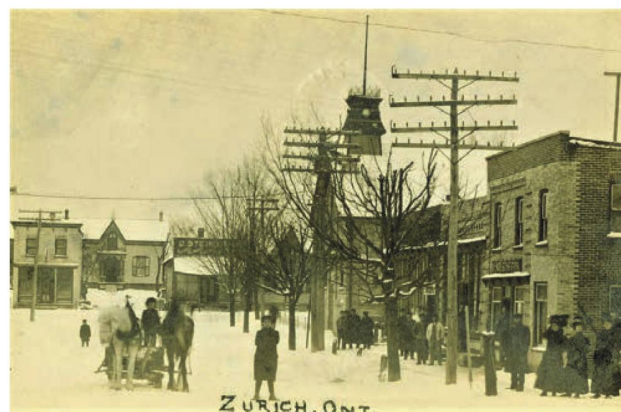
Namesake Puzzles Inspiration: Early Days in Zurich, Ontario.

sick, or perhaps they were just overly theme-oriented ("hey, we need a few more Swiss-inspired names around here"). Now, what we're after is the name of the lake these roads surround; needless to say, there's one in Switzerland just like that (only larger). First, find an anagram of the English term for those pointy traction enhancers on soccer shoes (plural!) and translate that into French. Then, after taking a break, renew your efforts. This will hopefully allow you to derive the name of our mystery lake!