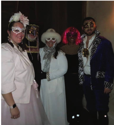
SASNOLA 12th Night Maskers at Hotel Peter and Paul