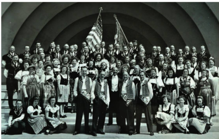
Harmonie hosts in 1948 at the Hollywood bowl

Everything you need to know about participation, concert tickets, festival registration, or hotel reservations can be found at www.swissfest2020.com . Or go directly to our ticket vending site www.itsmyseat.com/swissfest2020 to purchase Grand Concert tickets. All of us from the "Harmonie" look forward to seeing you at the festival!