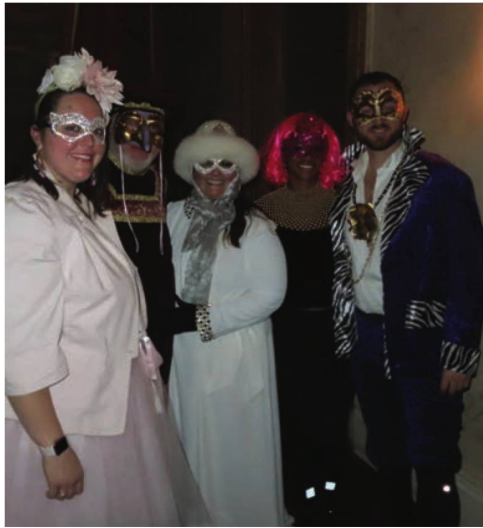
SASNOLA 12th Night Maskers at Hotel Peter and Paul