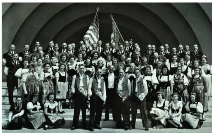
Harmonie hosts in 1948 at the Hollywood bowl

Everything you need to know about participation, concert tickets, festival registration, or hotel reservations can be found at www.swissfest2020.com . Or go directly to our ticket vending site www.itsmyseat.com/swissfest2020 to purchase Grand Concert tickets. All of us from the "Harmonie" look forward to seeing you at the festival!