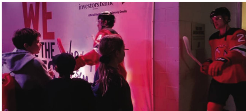
Fans in the High Five Tunnel