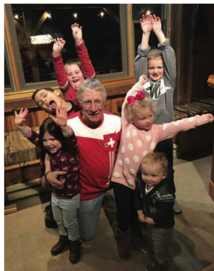
Our smallest snowboarder!