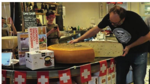
Cutting the wheel of Emmentaler at St. James Cheese Shop