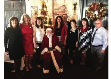
Board of Directors with Santa