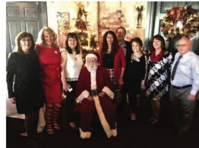
Board of Directors with Santa