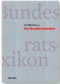
URS ALTERMATT (PUBLISHER): "DAS BUNDESRATSLEXIKON" (THE FEDERAL COUNCIL LEXICON), NZZ LIBRO, ZÜRICH 2019, 759 PAGES, CHF 98

For 171 years, the Swiss government has been in office without a single day's interruption. The whole government is never replaced at once, it is without exception the individual members who change. "Only monarchies enjoy the same continuity," writes Urs Altermatt in his Federal Council lexicon ("Das Bundesratslexikon"), a work that was first published under his name in 1991 and has now been revised and updated. Altermatt suggests that Switzerland's Federal Councillors are the country's "unofficial royals". His book is regarded as the definitive history of the Federal Council and a reference work for administra-