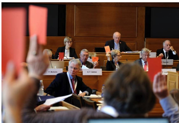
In session – the main focus of the CSA in Berne centred on the 2019 elections.

In Berne, the CSA decided that it will be making voting recommendations for the first time ever. Its objective in doing so is to take even greater account of the needs and concerns of Swiss Abroad in the forthcoming legislative period. These recommendations will be finalised at the next CSA meeting on 16 August 2019 in Montreux.