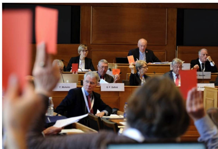
In session – the main focus of the CSA in Berne centred on the 2019 elections.

In Berne, the CSA decided that it will be making voting recommendations for the first time ever. Its objective in doing so is to take even greater account of the needs and concerns of Swiss Abroad in the forthcoming legislative period. These recommendations will be finalised at the next CSA meeting on 16 August 2019 in Montreux.