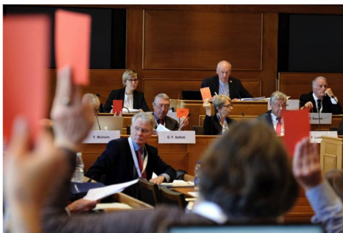
In session – the main focus of the CSA in Berne centred on the 2019 elections.

In Berne, the CSA decided that it will be making voting recommendations for the first time ever. Its objective in doing so is to take even greater account of the needs and concerns of Swiss Abroad in the forthcoming legislative period. These recommendations will be finalised at the next CSA meeting on 16 August 2019 in Montreux.