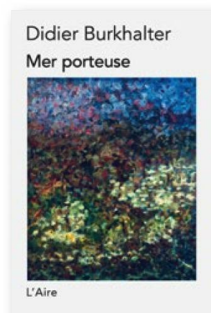
DIDIER BURKHALTER: "Mer porteuse". Editions de L'Aire, 2018, 194 pages, CHF 24.–, Euro 24.–

Written near Lake Neuchâtel, Didier Burkhalter's third novel, "Mer Porteuse", offers poetic prose set within the context of questions surrounding family ties and the strength of our origins. In this story of an abandoned child, the Atlantic Ocean becomes a character in its own right: a symbol of separation, yet also a form of connection for human beings. The former Federal Councillor writes beautifully, as displayed in a passage in which the plumes of smoke from an ocean liner create a lifeline attaching the vessel to the sky, "as if it were afraid of being snatched by the depths below". The novel's weakness is a certain linguistic sluggishness or pomposity that deems indifference necessarily