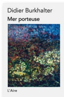
DIDIER BURKHALTER: "Mer porteuse". Editions de L'Aire, 2018, 194 pages, CHF 24.–, Euro 24.–

Written near Lake Neuchâtel, Didier Burkhalter's third novel, "Mer Porteuse", offers poetic prose set within the context of questions surrounding family ties and the strength of our origins. In this story of an abandoned child, the Atlantic Ocean becomes a character in its own right: a symbol of separation, yet also a form of connection for human beings. The former Federal Councillor writes beautifully, as displayed in a passage in which the plumes of smoke from an ocean liner create a lifeline attaching the vessel to the sky, "as if it were afraid of being snatched by the depths below". The novel's weakness is a certain linguistic sluggishness or pomposity that deems indifference necessarily