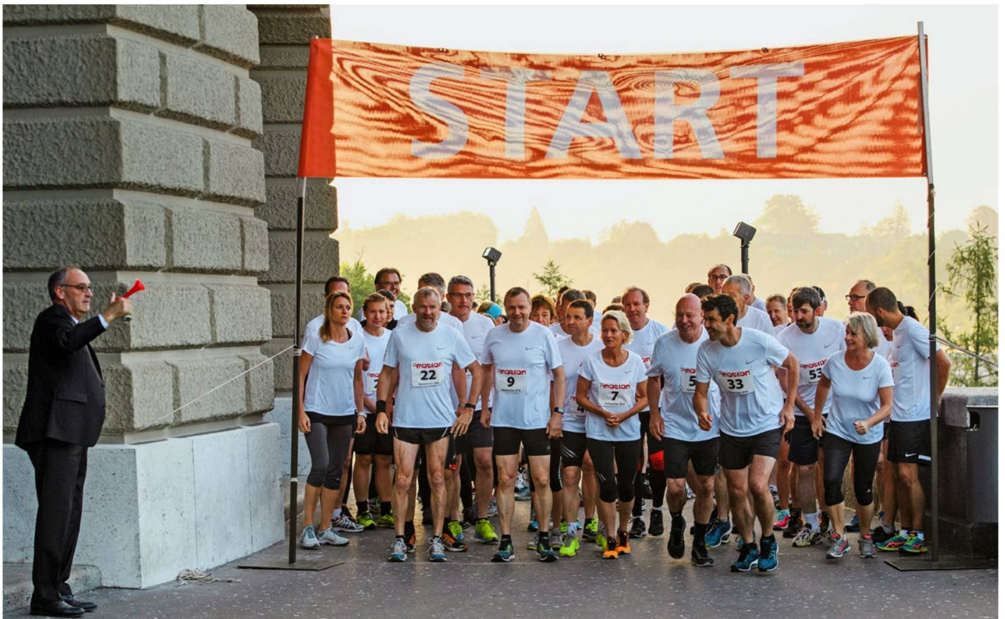
National Councillors and Council of States members run round the Federal Palace in the traditional annual parliamentarians race. Now the race is to the Federal Palace.

Shortly after the 2015 elections, parliament elected Guy Parmelin, a second SVP representative, to the national government. The four largest parties (2 SVP, 2 SP, 2 FDP, 1 CVP) were thus fairly represented in the Federal Council again, temporarily putting an end to the quarrels of recent years over the Federal Council seats. And the shift to the right during the National Council elections did not cause as much upheaval in the political landscape as had been expected in certain areas. The conservative block gained more votes in parliament than before and set the course for financial and social policy. Thus parliament