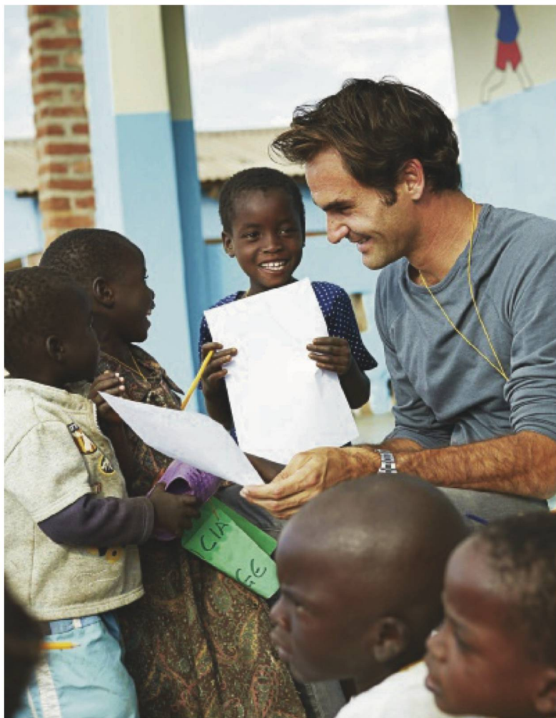
All the proceeds of the Match in Africa go to the Roger Federer Foundation.

proceeds of the Exhibition Night will go to the Roger Federer Foundation.