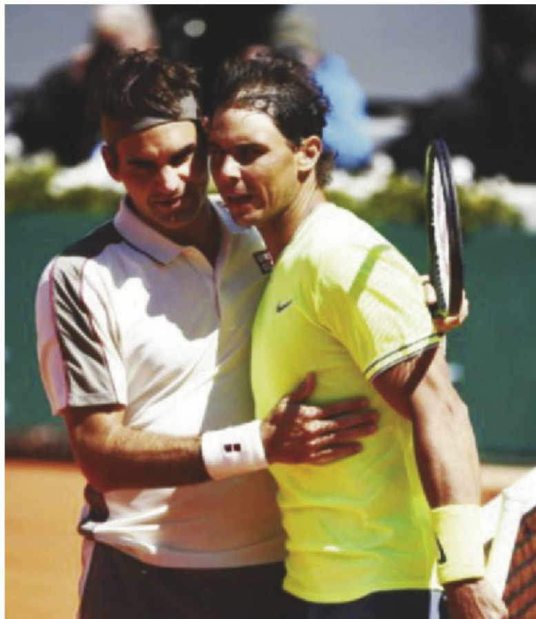
Federer and Nadal to attempt world attendance record in Cape Town.

The Match in Africa is presented by ROLEX, and Credit Suisse is one of the official sponsors. The net