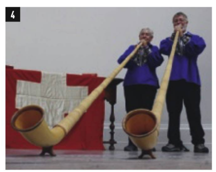
1: About 70 volunteers and over 200 people joining the National Day 2: Children enjoying the day 3: Ambassador Fasel's speech 4: Musicians playing the Alphorn