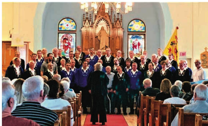
June 24 to 27, 2021 Singing and yodeling festival of the North American Swiss Singing Association (NASSA), Edmonton.