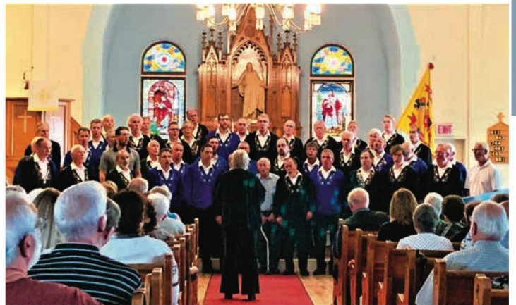
June 24 to 27, 2021 Singing and yodeling festival of the North American Swiss Singing Association (NASSA), Edmonton.