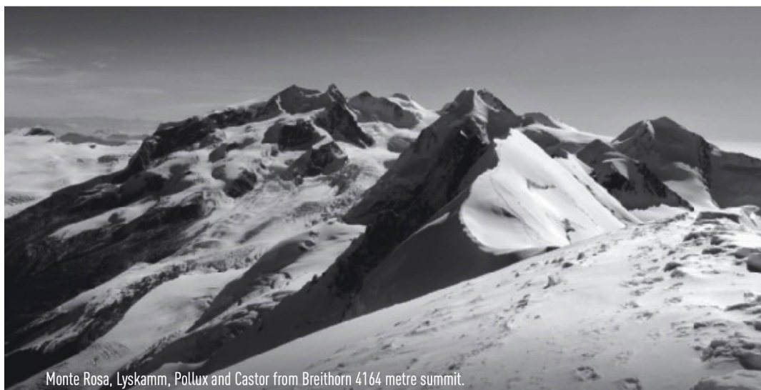
Monte Rosa, Lyskamm, Pollux and Castor from Breithorn 4164 metre summit.

Church & Heritage Centre, Quarry St, Guildford, Surrey from mid-August. If you would like to receive updates on new work or exhibitions, please contact fi@alpinephotos@gmail.com