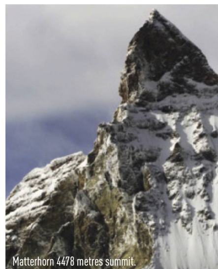
Matterhorn 4478 metres summit.