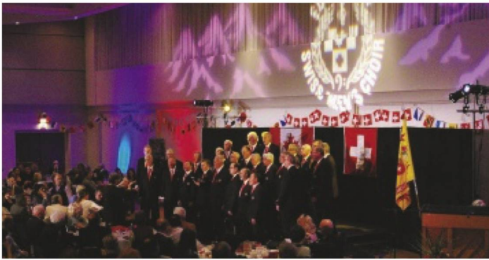
The Edmonton Swiss Men's Choir at Winzerfest 2018

On November 10, 2018, the Edmonton Swiss Men's Choir hosted another successful Winzerfest at St. Basil's Cultural Centre in Edmonton. 2018's theme "Celebrating Friends, Food and Song" truly resonated with the audience. The choir delivered one of its stronger performances, supported by the Swiss Dance Club Alpenroesli from Calgary - a memorable evening for all!