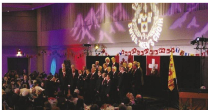
The Edmonton Swiss Men's Choir at Winzerfest 2018

On November 10, 2018, the Edmonton Swiss Men's Choir hosted another successful Winzerfest at St. Basil's Cultural Centre in Edmonton. 2018's theme "Celebrating Friends, Food and Song" truly resonated with the audience. The choir delivered one of its stronger performances, supported by the Swiss Dance Club Alpenroesli from Calgary - a memorable evening for all!