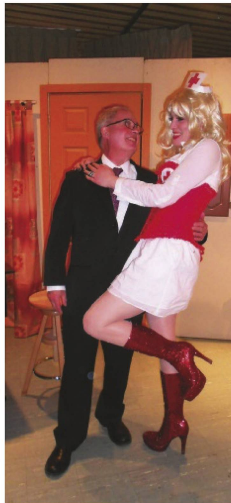
Above: Two scenes from "Miss Sophies Erbe" (Miss Sophie's Inheritance)