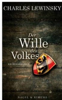
CHARLES LEWINSKY: "DER WILLE DES VOLKES". Nagel & Kimche, 2017. 384 pages, CHF 27.90, EUR 24.

Kurt Weilemann is a retired old-school journalist for whom professionalism meant in-depth research and a correct use of language. The times have changed and he is now surplus to requirements. One day, Derendinger, a former colleague, asks to meet him. Derendinger seems so confused that Weilemann suspects he might be ill. But when Derendinger is found dead a few hours later, Weilemann quickly realises that it couldn't possibly have been suicide, as is officially claimed. His curiosity is aroused and he is egged on by Eliza, a young friend of the deceased. When he starts researching the case, he stumbles across a potentially explosive