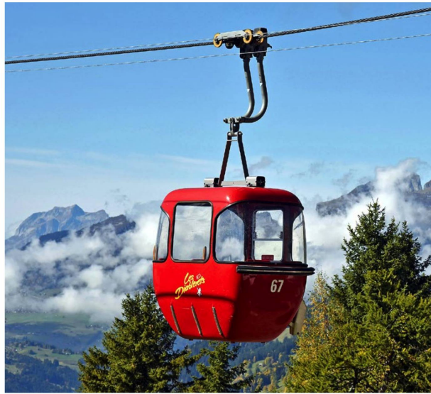
The bright red Giovanola gondolas from the 1970s were in operation until April 2017. The Federal Office of Transport did not renew the licence, but there are plans for a replacement system.