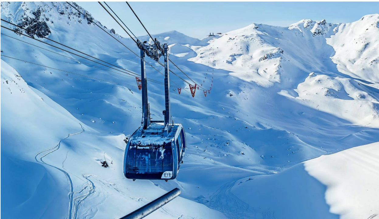
The "Urdenbahn" in Arosa and Lenzerheide is Switzerland's fastest cable car. The stanchion-free aerial tramway has connected two ski resorts since 2014 without having to open up new slopes.