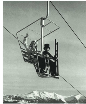
These two "harbingers of good fortune" opened the world's first detachable chairlift on 16 December 1945 in Flims.