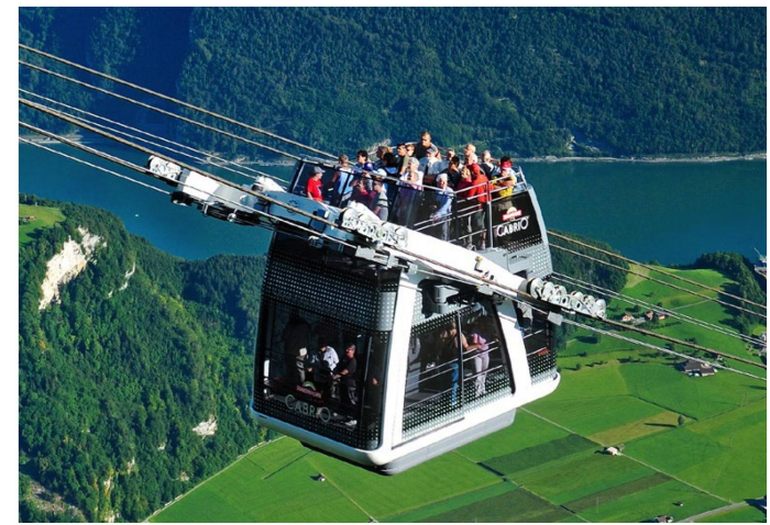
A world first built in 2012: a convertible-style cable car at Stanserhorn in Nidwalden.