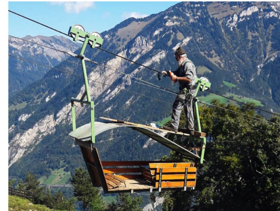
Small cable cars are a vital lifeline for many families and alpine farms in central Switzerland – one of these is the Bärchibahn near Isenthal which has been in operation since 1979.