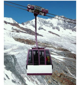
This system represents a remarkable piece of innovation. The world's first aerial cable car on three cables has been travelling up the mountain in Saas Fee since 1991.