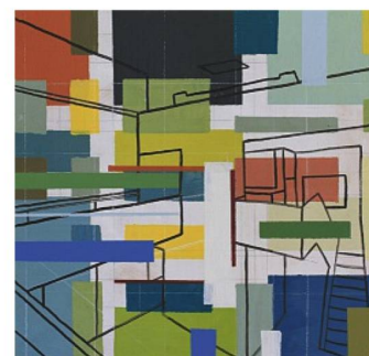
Le Corbusier, Entrance of Villa La Roche, Paris. Oil on plywood, 35 x 35cm