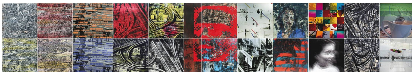
Reflexorama fries. Variety of media, 122 x 720cm