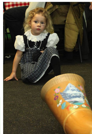
Edmonton Swiss Society family events of 2017