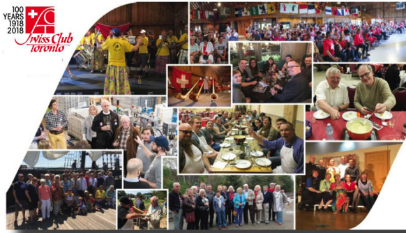
Toronto Swiss Club (above), Matterhorn Swiss Club (below)