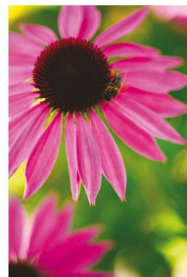
Flowering Echinacea Purpurea