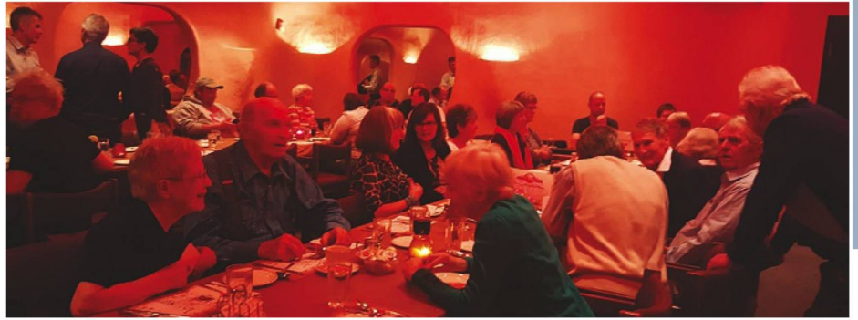
Swiss Club Saskatoon Members at the Annual General Meeting in October 2017